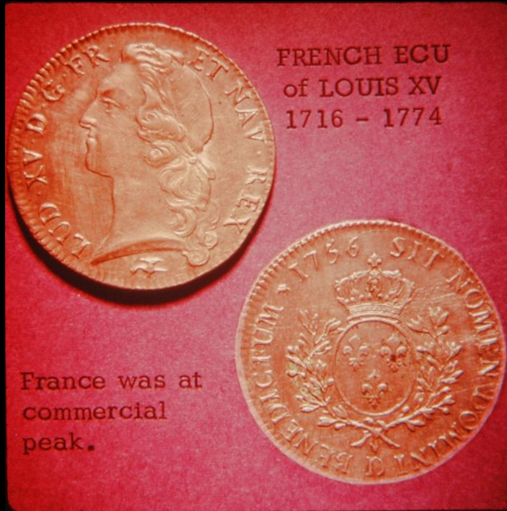
FRENCH ECU of LOUIS XV 1716 - 1774